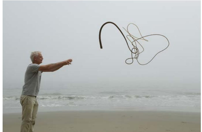
Kelp thrown into a grey, overcast sky. Drakes Beach, California. 14 July 2013. unique archival inkjet print 21 x 31.5 inches

Drawing Water Standing Still also features several new videos, all on view for the first time on the West Coast. Some are body-based incursions within the terrain, at once visceral and proximate, such as Ice walk. Dumfriesshire, Scotland. 6 January 2016 , which traces Goldsworthy's own strenuous physical incursion into the landscape. Other videos, such as