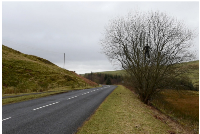
Pass. Dumfriesshire, Scotland. February, March 2016 multi-channel digital video, color, sound 11:00, 12:00 and 9:25 (looped), edition of 3 + 1 AP