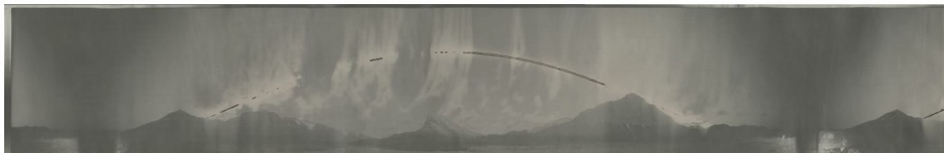
Chris McCaw, Cirkut #3 (Dietrich River, Alaska, Within the Arctic Circle, 29 Hours) , 2015 Silver-based paper negative 8 x 49.5 inches

Opening Reception: Thursday, March 9, 5:30 pm to 7:30 pm