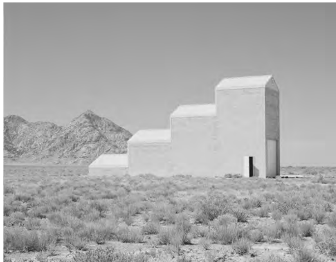
Air Force Target Grid Building 04, Dugway Proving Ground, Utah, 2014 archival pigment print 21 x 27 inches

A series of six black-and-white photographs ( Air Force Target Grid Building , 2014) portrays a ziggurat-like structure from sequential angles, and recalls the stark landscape photography of the New Topographics. An interior image of a test chamber in a laboratory designed for neutralizing and decontaminating biological toxins ( Referee Module Interior , 2014) seems to delineate a zone where our known world encounters an alien other.