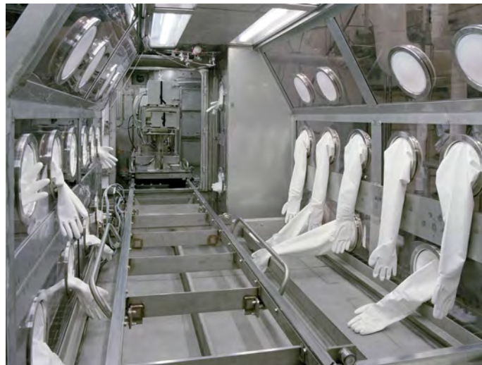
Referee Module Interior (5370_04), Whole System Live Agent Test Laboratory, 2014 archival pigment print 30 x 40 inches