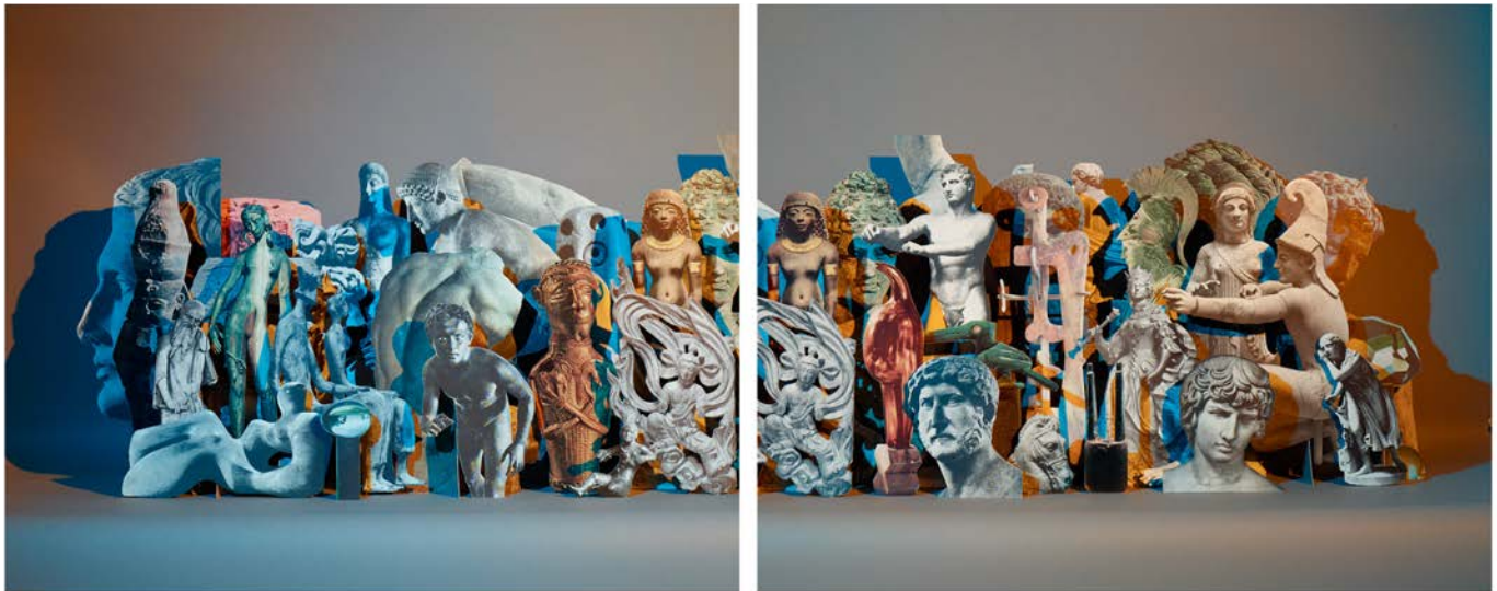
Matt Lipps, Untitled (Sculpture) , 2010 C-Print, diptych, 33 x 44 inches each

The figures in Matt Lipps' large-scale photographs are cut from pages of Horizon , a mid-century American art and culture magazine, and arranged into complex groupings that amplify the role that images play in transmitting the dominant myths of a culture.