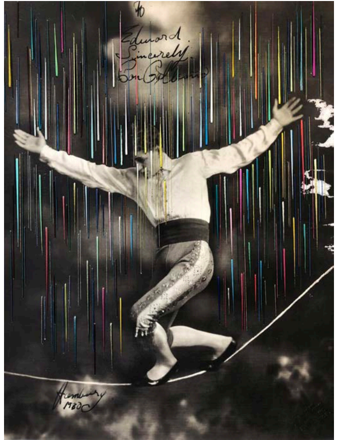
Galliano , 2018 Embroidery on found photograph 19 x 15 inches

The exhibition also features the Anzeri's first video work, also entitled In-Equilibrio (2018), created in collaboration with Italian filmmaker Marco Molinelli. The video traverses surreal scenes of landscapes and portraits transformed by diagrammatic filigrees of thread, bringing further dimensionality to already-sculptural work.